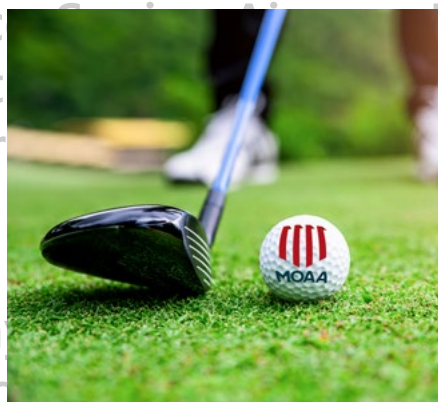
JULY 17, 2021 MOAA LAND OF LINCOLN CHAPTER GOLF OUTING 32 PARTICIPANTS