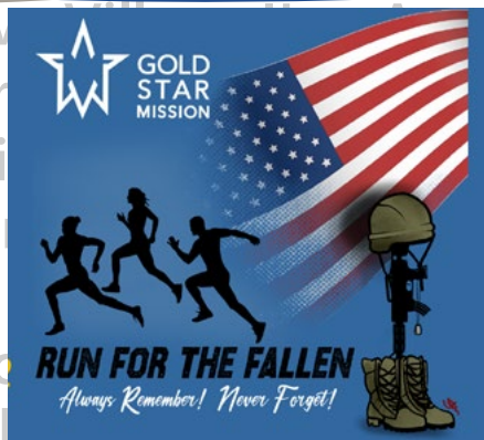
MAY 1-15, 2021 VIRTUAL RUN FOR THE FALLEN 26 PARTICIPANTS STATEWIDE 198 MILES RUN CUMULATIVELY