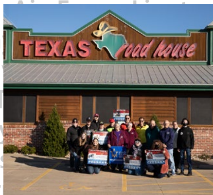
NOVEMBER 11, 2021 VETERANS DAY AT TEXAS ROADHOUSE 16 PARTICIPANTS

IN 2021, PARTICIPANTS IN GOLD STAR MISSION EVENTS RAN NEARLY 200 MILES AND RODE OVER 26,900 MILES!