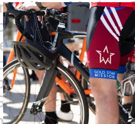
SEPTEMBER 21-25 GOLD STAR 500 18 RIDERS, 40+ VOLUNTEERS 9,990 MILES RIDDEN CUMULATIVELY