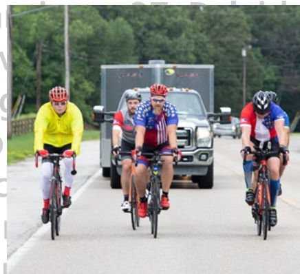
JULY 9-10, 2021 GENERAL LOGAN 200 7 RIDERS, 4 VOLUNTEERS 1,526 MILES RIDDEN CUMULATIVELY