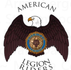
American Legion Riders 568