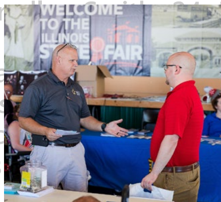
AUGUST 14, 2021 VETERANS DAY AT THE ILLINOIS STATE FAIR 14 PARTICIPANTS