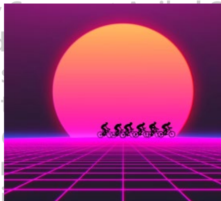
JUNE 1-30, 2021 VIRTUAL GS 300/500 32 PARTICIPANTS STATEWIDE 14,600 MILES RIDDEN CUMULATIVELY